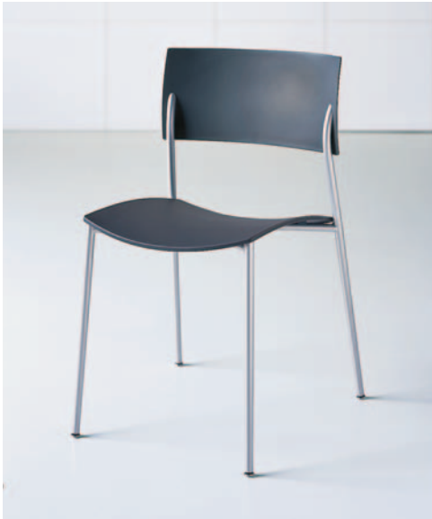
CH-8010-MS CH-Graphite / Matte Silver