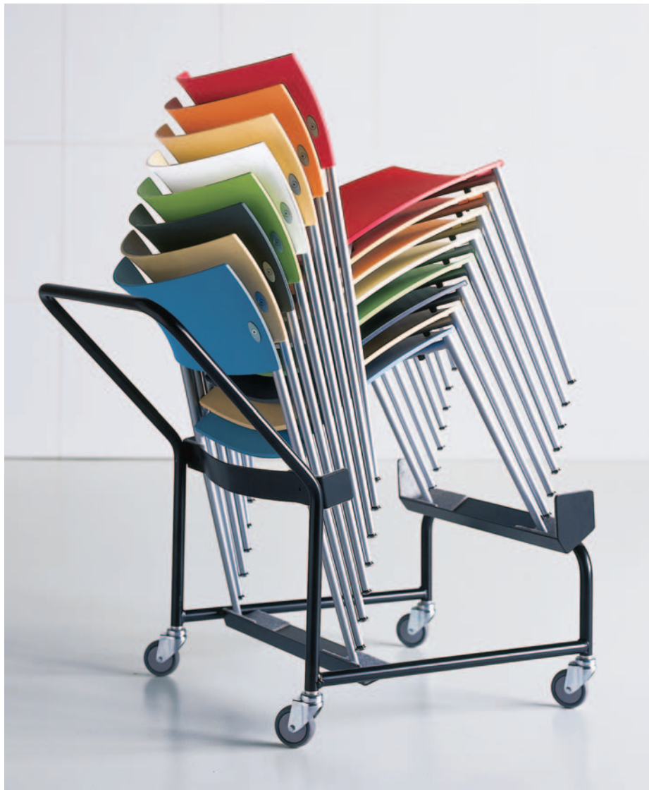
CH-Cart-BL Cart / Black Finish

photo below: Eight - CH-8010-MS / colors top to bottom: CH-Really Red, CH-Tangy, CH-Butter, CH-Crystal, CH-Celery, CH-Graphite, CH-Lemoncello, CH-Cool Water.