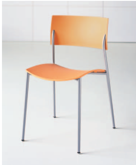
CH-8010-MS CH-Tangy / Matte Silver