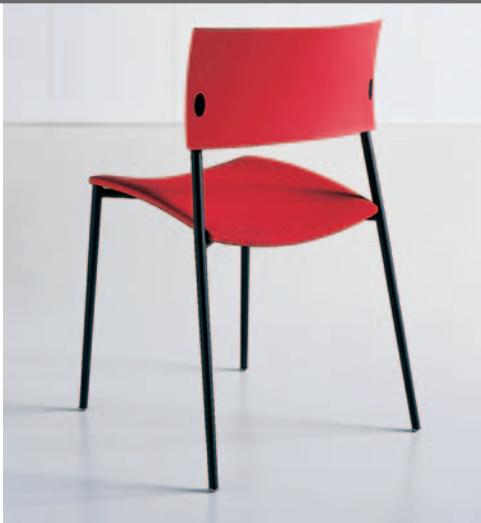
CH-8012-MB / CH-Really Red / Matte Black Milestone - 403901-047 Rush Plastic Back / Upholstered Seat