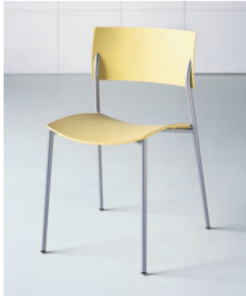
CH-8010-MS CH-Lemoncello / Matte Silver