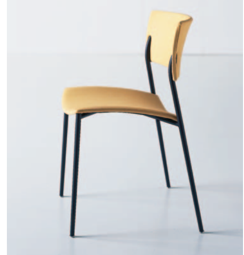
CH-8020-MB / Matte Black Milestone - 403901-040 Marigold All Upholstered

This chair series may be specified in three upholstery variations shown at right. Due to upholstery constraints, only Milestone from Maharam is available. Please refer to your Maharam fabric library for color selection and availability.