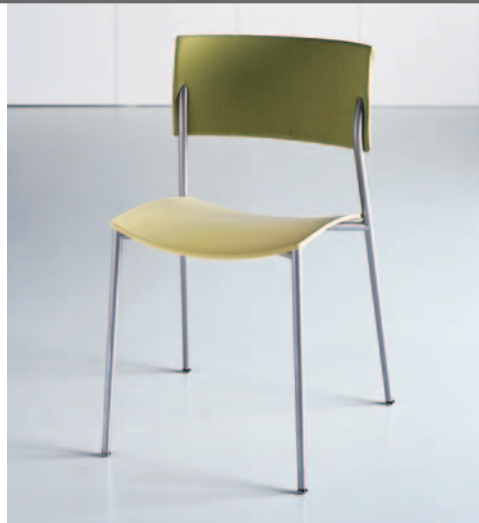
CH-8021-MS / CH-Lemoncello / Matte Silver Milestone - 403901-037 Spring Upholstered Back / Plastic Seat