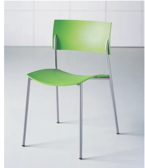
CH-8010-MS CH-Celery / Matte Silver