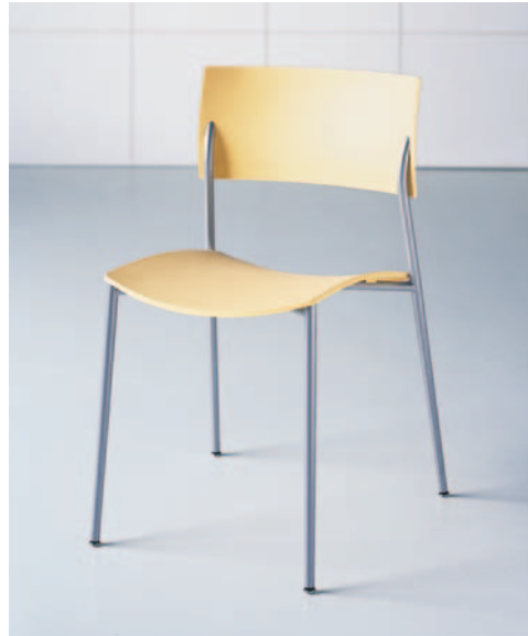
CH-8010-MS CH-Butter / Matte Silver

All Plastic Overall 18 1/2 W 20 7/8 D 31 3/4 H Inside 18 1/2 W 17 3/4 D 14 H Seat Ht. 17 1/2