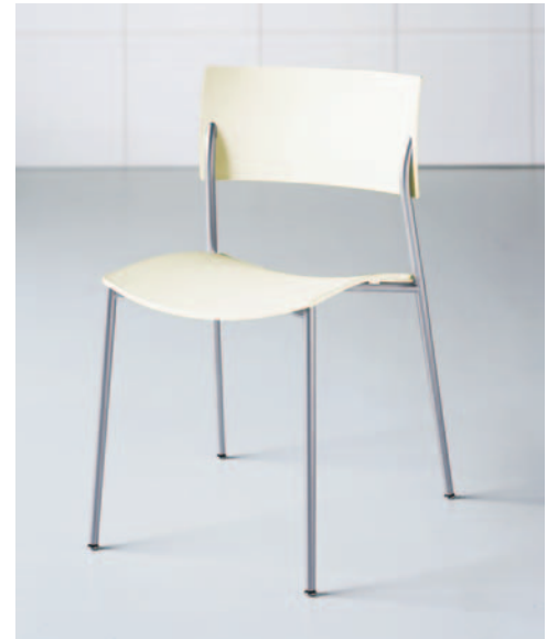
CH-8010-MS CH-Crystal / Matte Silver