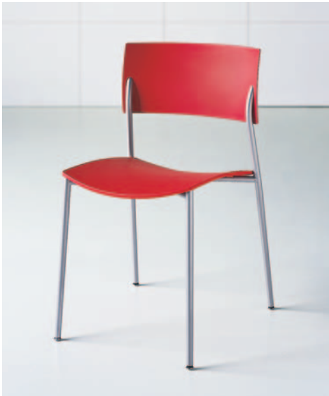
CH-8010-MS CH-Really Red / Matte Silver