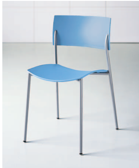
CH-8010-MS CH-Cool Water / Matte Silver